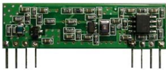
Module size 44 X12 X 7mm