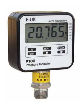
P100 Digital gauge Accuracy 0.05 % FS