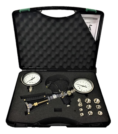
PGS40 Pressure Test Kit (Gauges not included)