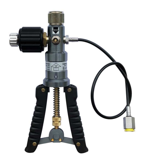
PGS40-OEM Hand Pump and hose