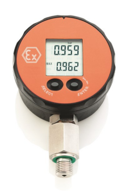
P11 Digital gauge ATEX