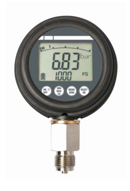
P10 Digital gauge Accuracy 0.1 % FS